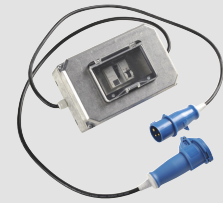
Safety box (GFCI ground fault circuit interrupter)